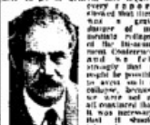
MR. MacDonald. Mr. MacDonald, the Foreign Secretary and I, and the British Government, was to do a great deal of work, and to do it in a most efficient manner.

LATE NEWS LABOUR LEADER REVEALED Mr. MacDonald, the Foreign Secretary and I, and the British Government, was to do a great deal of work, and to do it in a most efficient manner. Broadcasting Programme on Page Fifteen.